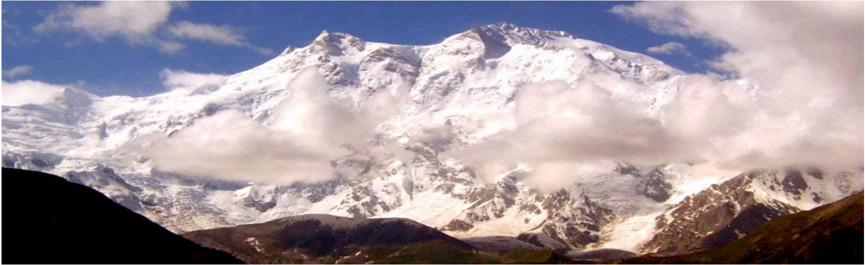
View of the Nanga Parbat in the Himalayas, historically closely connected with German and Austrian Alpinism

German 2251 - German Literature and Popular Culture