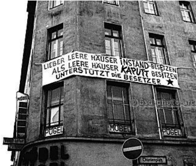
Squat in Berlin-Kreuzberg, 1980s

From medieval babes with magical sex-powers (the Nibelungenlied ) to drug-addicted teen prostitutes in punk-rock-80s Berlin ( Christiane F. ), the history of German-language cultural expression is in many ways a history of two things that often overlap: sex, and the city. In this survey course—taught entirely in ENGLISH—we will hone our vital criticism and communication skills as we explore the many relationships between urban life, sexuality and gender in the art, architecture, literature, philosophy, and film of Germany, Austria and Switzerland from the 13 th Century to the 2000s.